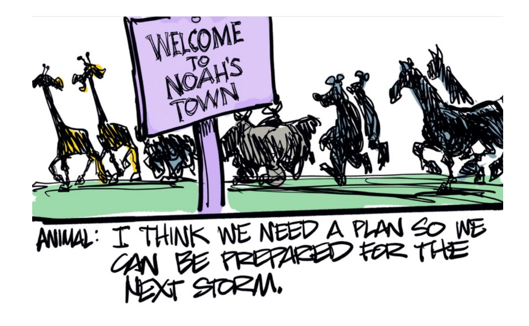
Cover of Noah's Town: Where Animals Reign, by Maury Forman.

Studies have shown that after a major disaster hits a downtown, one in four businesses never reopen again. In rural communities the percentage of businesses that don't recover is as high as 60%. The International Downtown Association reports that downtowns average just three percent of citywide land, but can account for 31% of citywide tax revenue. This means for every one percent of citywide land, downtowns provide approximately 10% of the tax revenue in the form of contributions to the city's assessment base and generating property tax revenues.